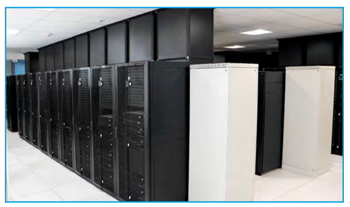
The cabinet solution includes CPI's GF-Series GlobalFrame® Gen 2 Cabinet with Vertical Exhaust Duct, Monitored eConnect® PDUs and cable management accessories.