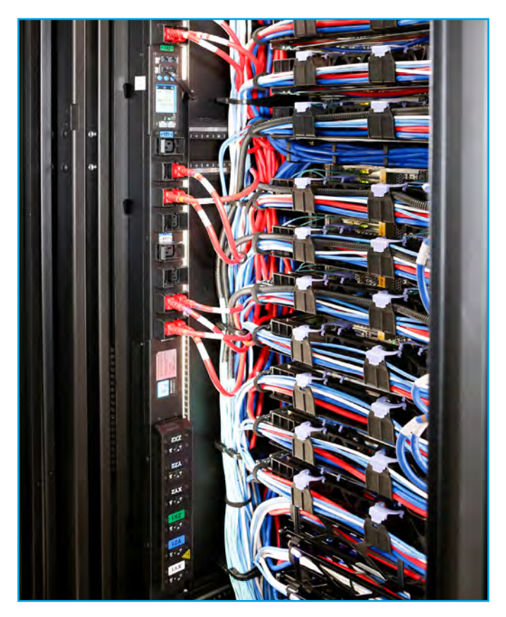
CPI's Monitored eConnect<sup>®</sup> PDUs support two temperature and humidity probes providing temperature and humidity measurement at each cabinet, and feature Secure Array<sup>®</sup> IP Consolidation technology, which greatly reduces the number of networking ports required for the PDUs.

It's been said that the journey of a thousand miles begins with a single step. Anthem's journey is well-planned, carefully executed and strongly supported by a solid partnership between Anthem, Anixter and CPI.