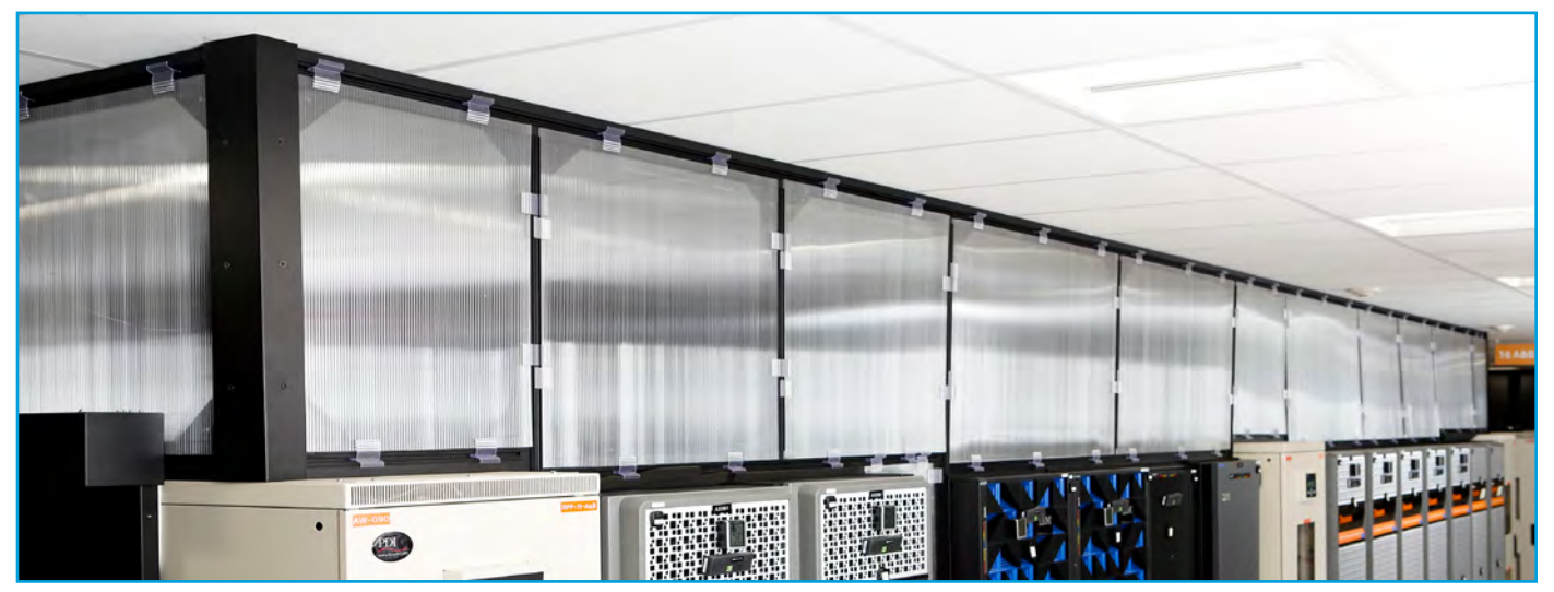
For airflow containment at the aisle level, the flexibility and onsite customization features of CPI's Build To Spec Kit (BTS) Hot Aisle Containment (HAC) contains the hot exhaust generated by existing, multi-vendor cabinets.

The path to improvement began with a complete containment strategy at both the cabinet and aisle level, composed of CPI products that are now a standard specification for all Anthem data centers.