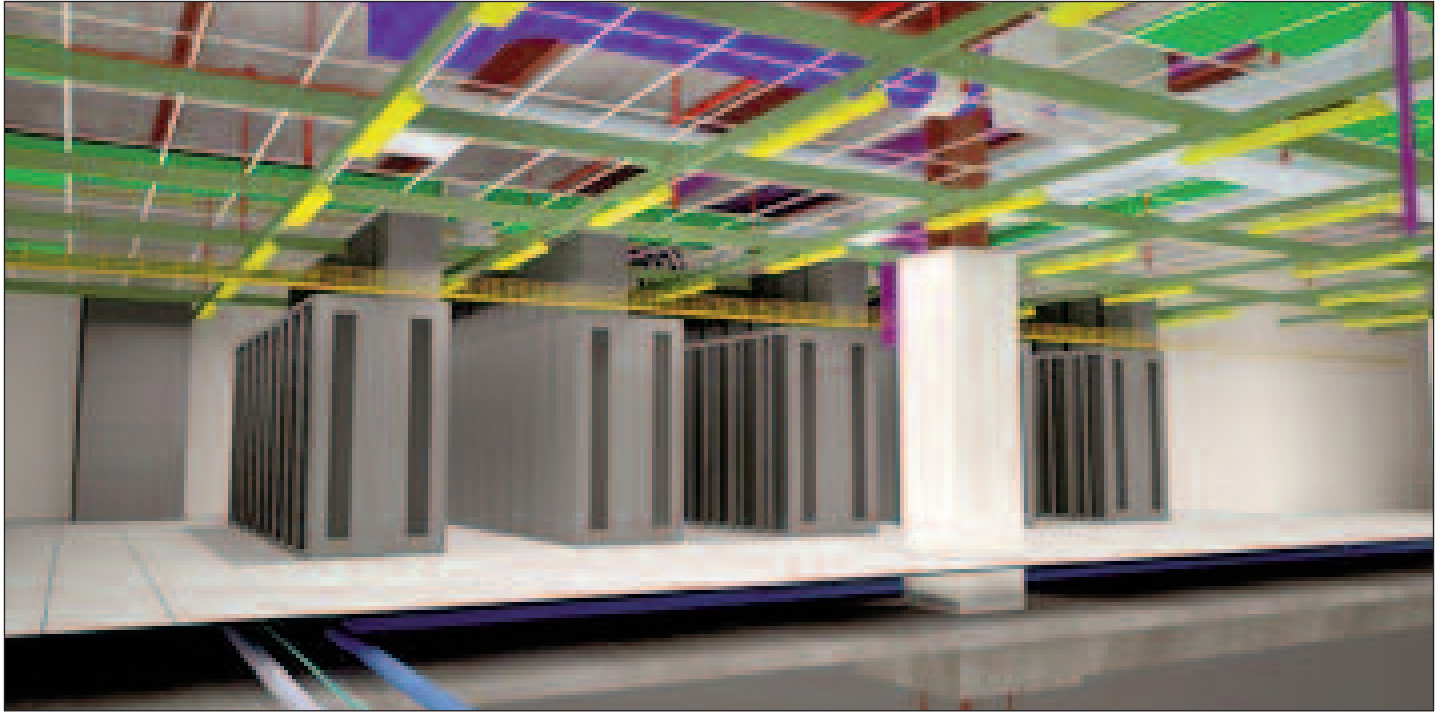
Rendered image of proposed Phoenix Children's Hospital Data Center Computer Room using Virtual Construction

“ Having the second half of the data center planned in advance provided a growth master plan for the hospital as its needs increased. ”