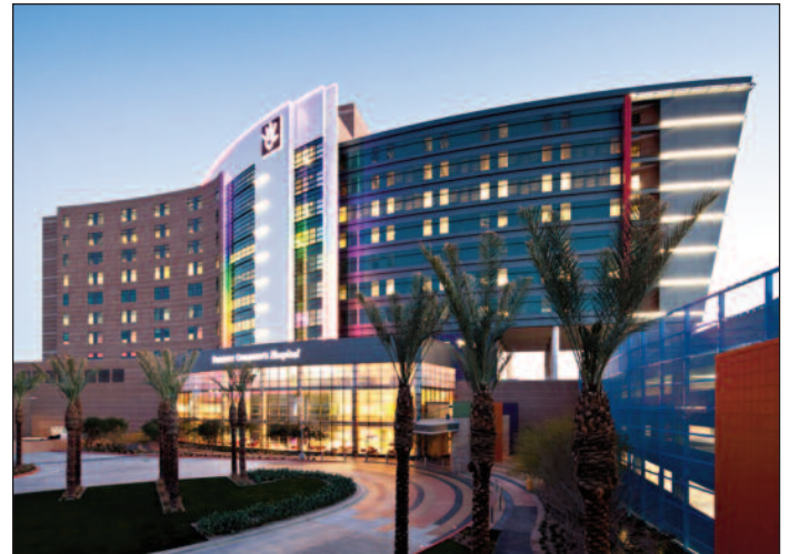
Phoenix Children's Hospital, Photography by Blake Marvin/HKS, Inc.

products and the most energy efficient methods for thermal management, all of which give the hospital's data center an adaptable configuration that will serve it far into the future.