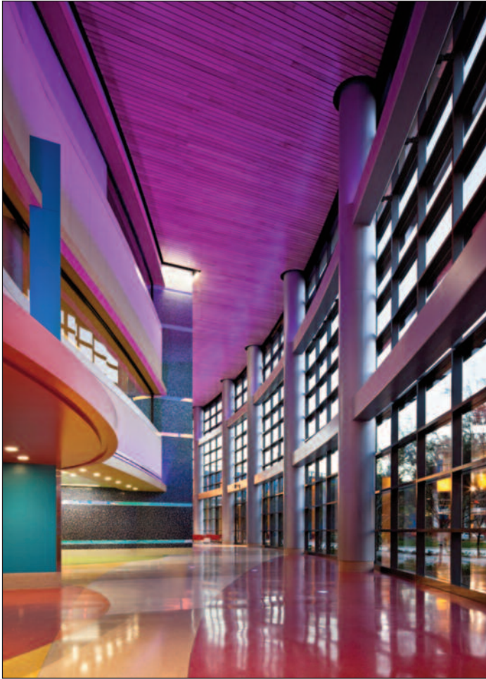
Phoenix Children's Hospital Lobby, Photography by Blake Marvin/HKS, Inc.

increase their database to store valuable, life-saving information with increased capabilities to maintain patient safety and confidentiality.