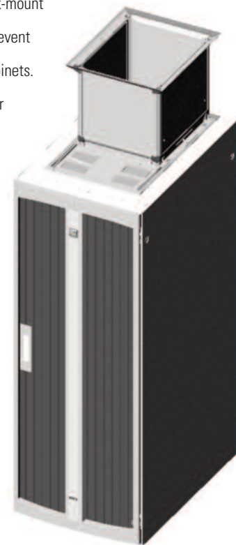
Rendering of a custom CPI TeraFrame® Cabinet with Vertical Exhaust Duct