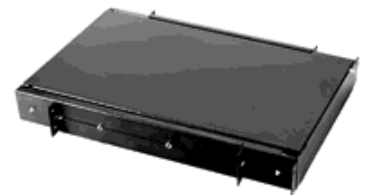
Front lever locks shelf in the closed position to provide stability.